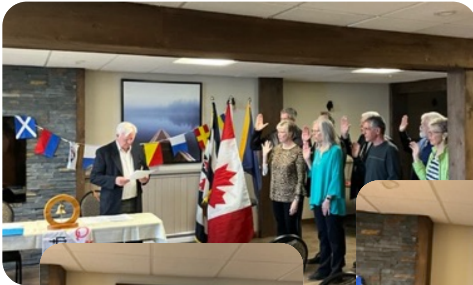
Swearing in of officers. and presentation of letters and merit marks