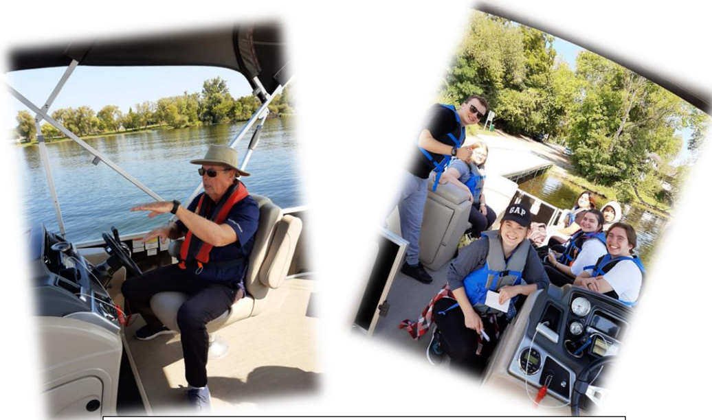
Images from the Master's Seminary Fun Run